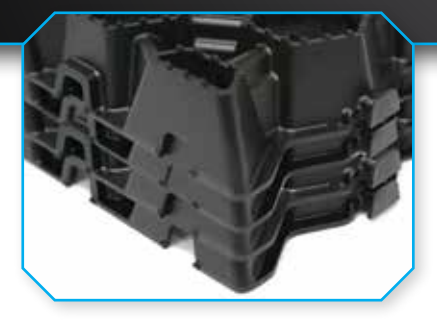
Designed to nest neatly for safe and efficient storage and transport