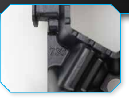
Embossed numeric measurements make cutting to size easy